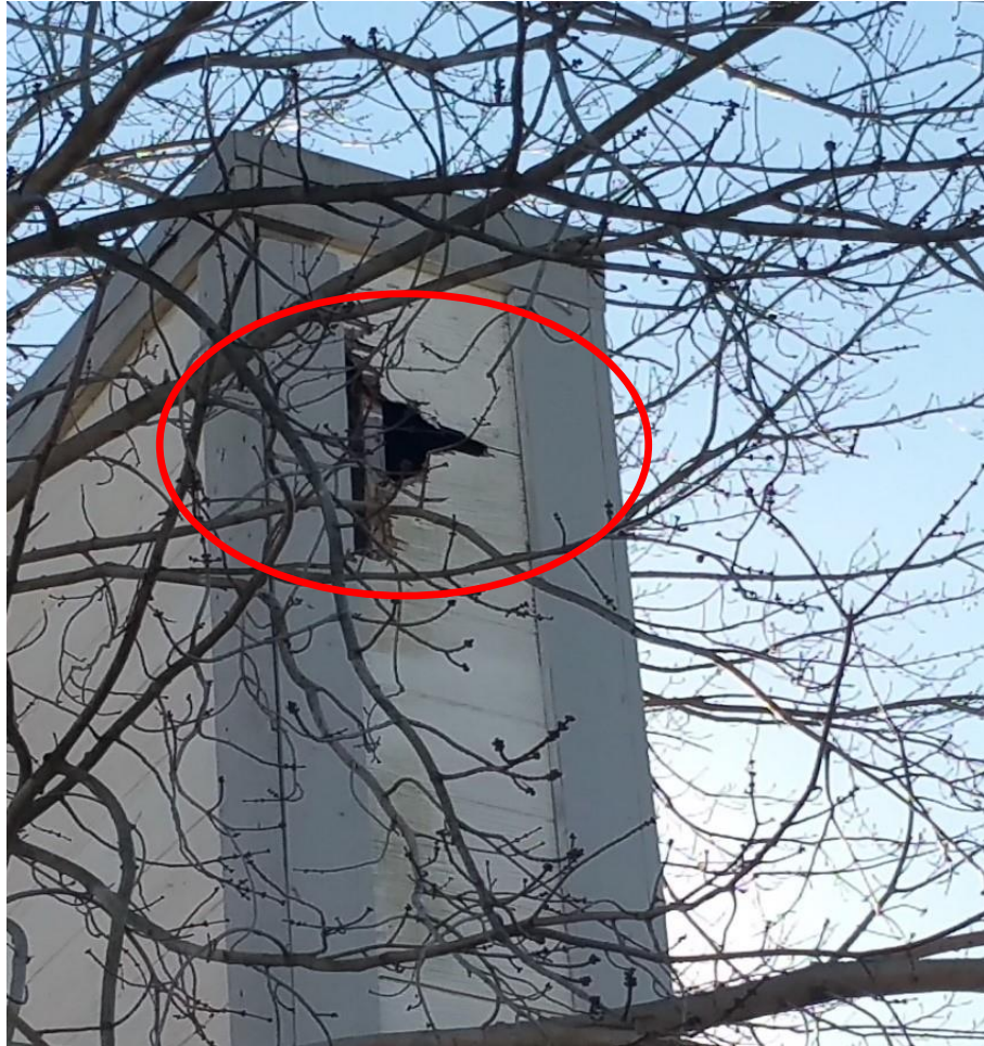
Before: Hole in the siding of home's chimney