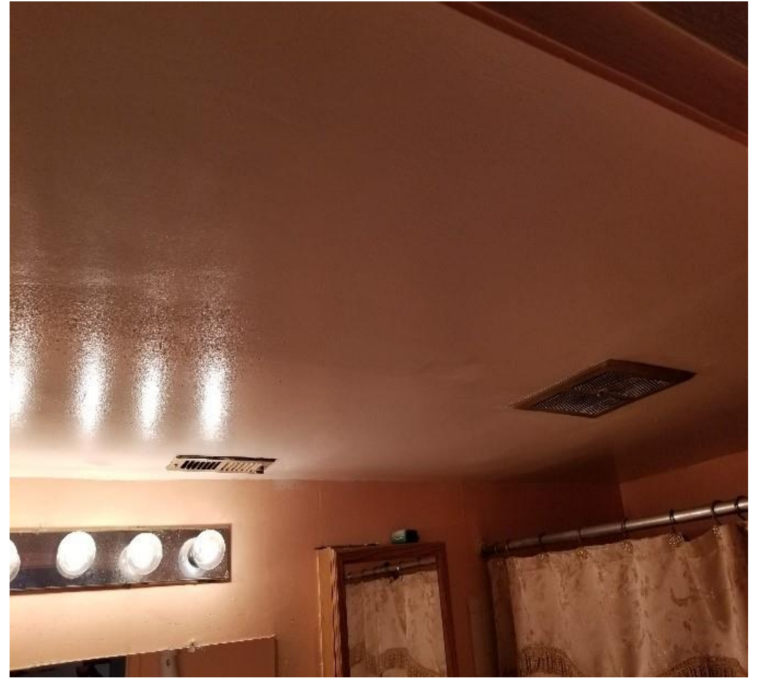
After: Leak fixed, ceiling repaired and repainted