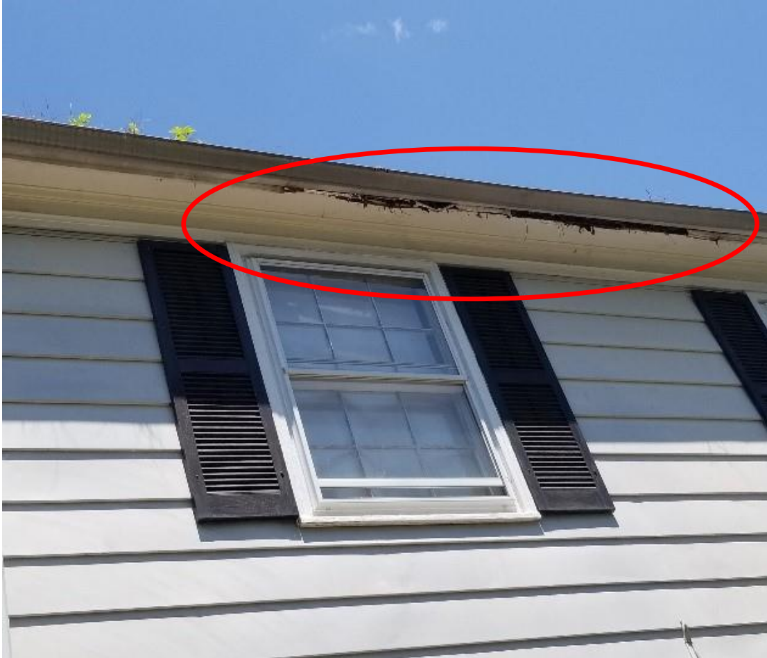
Before: Rotting soffit caused by overflow from clogged gutter