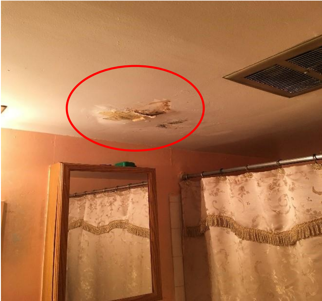
Before: Toilet Leak from unit above