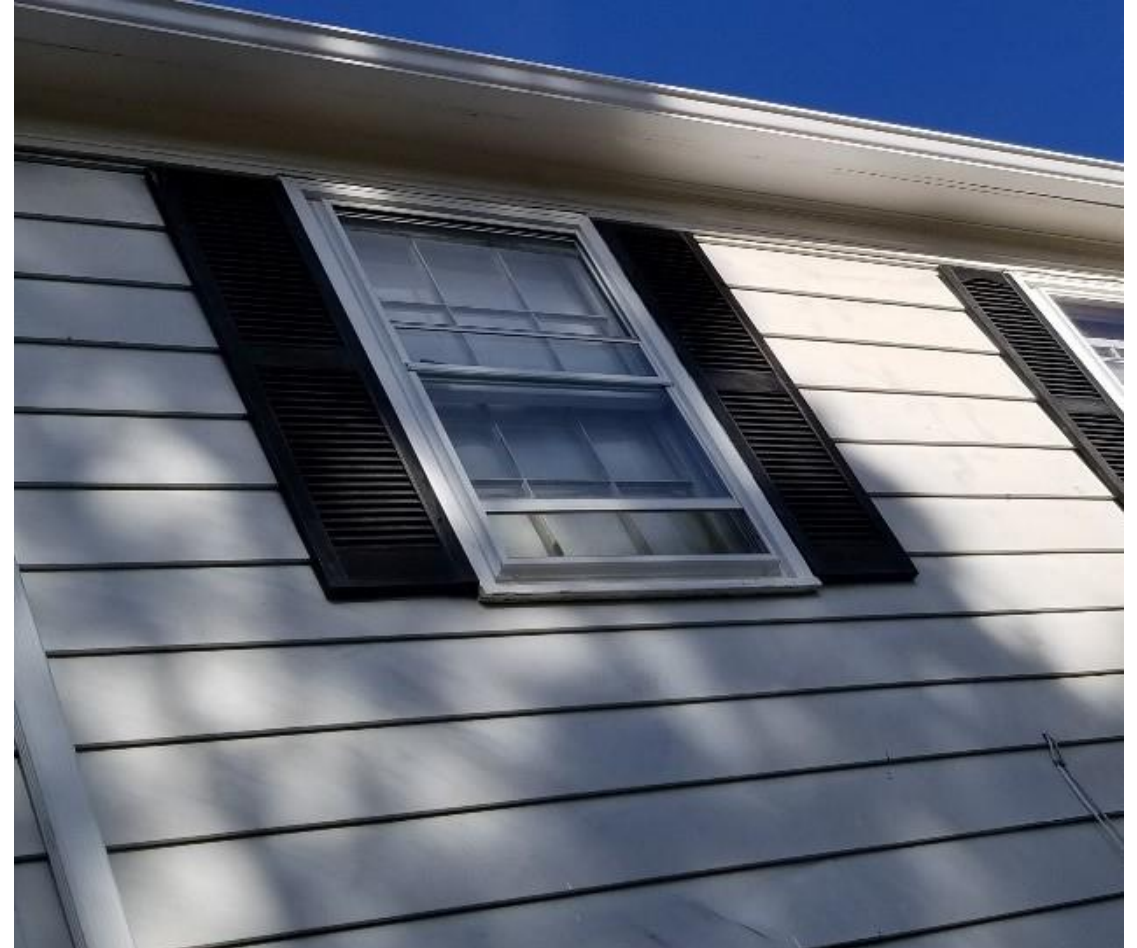
After: Soffit and gutter replaced