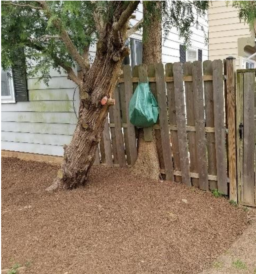
Before: If trees are too close to a house, they could begin to grow through your fence or cause cracks in the foundation