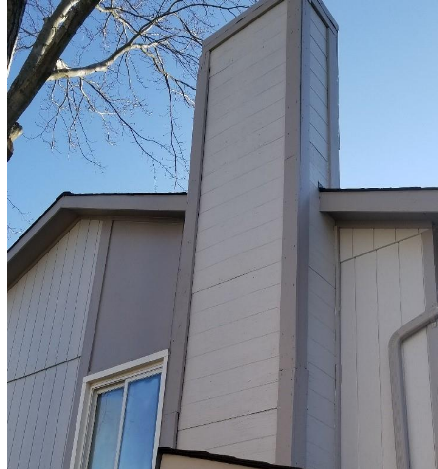
After: Hole repaired and painted